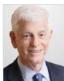
MARIO J. GABELLI, CFA Chief Executive Officer GAMCO Investors, Inc.