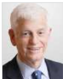
MARIO J. GABELLI, CFA Chief Executive Officer GAMCO Investors, Inc.