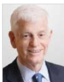
MARIO J. GABELLI, CFA Chief Executive Officer GAMCO Investors, Inc.