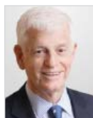
MARIO J. GABELLI, CFA Chief Executive Officer GAMCO Investors, Inc.