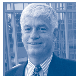
Mario Gabelli, CFA

Morningstar® rated The Gabelli Equity Income Fund Class AAA Shares 5 stars overall and 5 stars for the three, five and ten year periods ended December 31, 2009 among 1,104; 1,104; 912; and 459 Large Value funds, respectively.