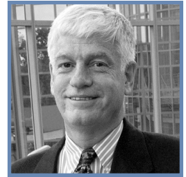
Mario Gabelli, CFA

Morningstar® rated The Gabelli Equity Income Fund Class AAA Shares 5 stars overall and 5 stars for the three, five and ten year periods ended December 31, 2009 among 1,104; 1,104; 912; and 459 Large Value funds, respectively.